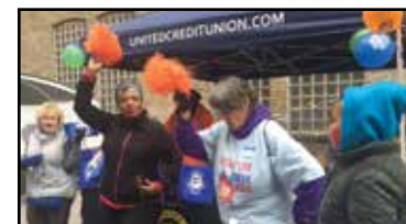
CROP Hunger Walk