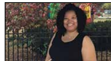
Norwood Park Fall Festival