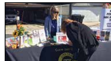
St. Bruno Blocktober Fest