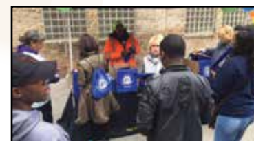
CROP Hunger Walk