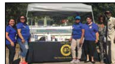
Hyde Park Jazz Festival