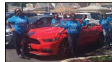
Family Car Sale & Block Party

Don't forget to like our Facebook page to stay informed of upcoming events in your area.